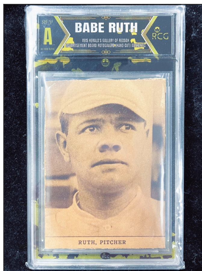
This Babe Ruth card – the only one of its kind known to exist – was stolen locally before being recovered.