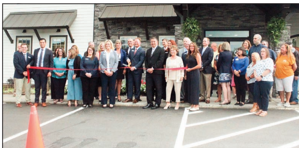
River City Bank held a Grand Opening Ribbon Cutting Sept. 22 for its newest facility in the renovated Fatz Restaurant building.

River City Bank has been a part of Blairsville since October 2020, and now, with the Grand Opening and Ribbon Cutting for their new location at 206 Hwy 515, the bank is ready to establish a more prominent place in the community.