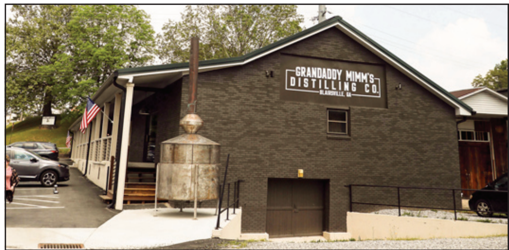
Granddaddy Mimm's Distilling Co. is located just down the street from the Blairsville Square at 112 Wellborn Street.

recipes," Townsend explained. You can catch Granddaddy Mimm's Distilling Co. in